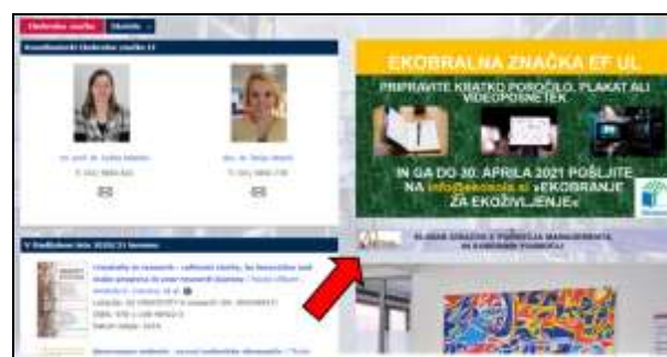
Figure 1: Ecoreading badge webpage

are activities for students, alumni, key stakeholders, staff and retired personnel. Aim is also to raise awareness in Slovene business terminology, therefore we also published a vocabulary in collaboration with the Slovene Academy of Management – Section for terminology (Figure 1).