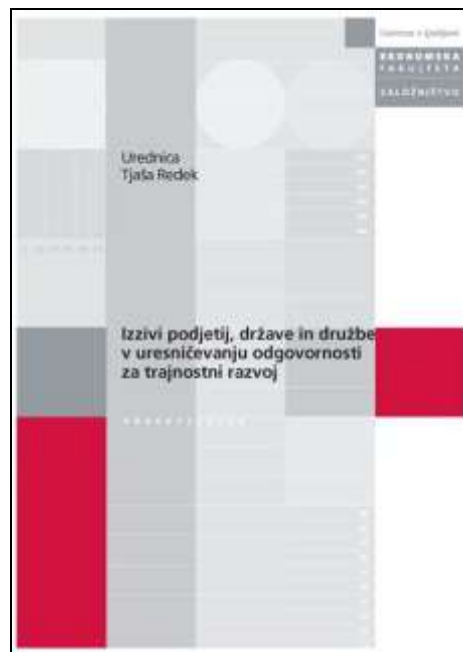
Figure 3: Cover page of the edited book from the

In the study year 2021/22 we read [5] Walker, M. (2019). Zakaj spimo: moč spanja in sanj . Ljubljana: Mladinsko knjiga; [6] Dweck, C.S. (2017). Mindest: changing the way you think to fulfil your potential . London: Robinson; [7] T. Redek, T. (ed.; 2021). Izzivi podjetij, države in družbe v uresničevanju odgovornosti za trajnostni razvoj . Ljubljana: Ekonomska fakulteta UL.