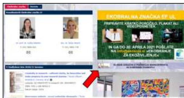
Figure 1: Ecoreading badge webpage

are activities for students, alumni, key stakeholders, staff and retired personnel. Aim is also to raise awareness in Slovene business terminology, therefore we also published a vocabulary in collaboration with the Slovene Academy of Management – Section for terminology (Figure 1).