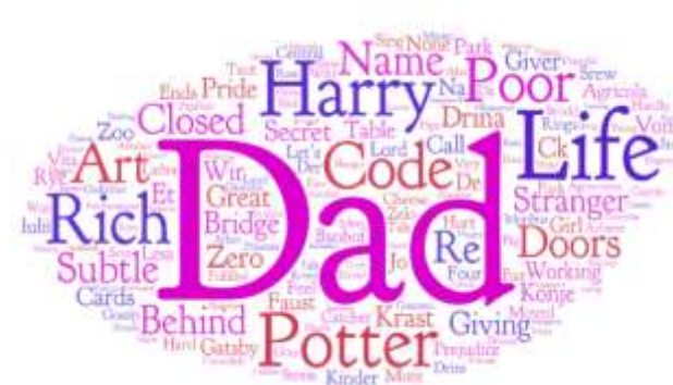
Figure 2: Wordcloud of book titles that students named as their favourite books