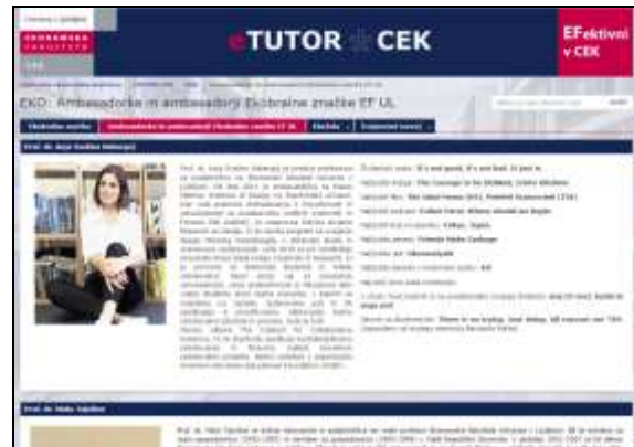
Figure 4: Ambassadors of ecoreading badge

In order to invite readers into environmental topics we also share favourite books from passionate readers from our academic community who also role as ambassadors of spreading reading culture among our stakeholders (Figure 4):