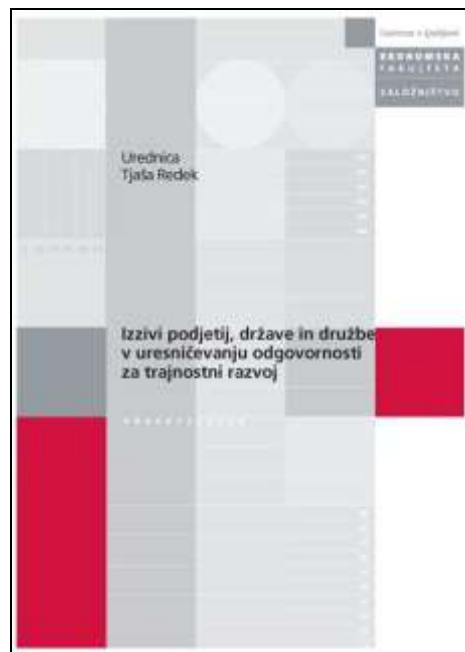
Figure 3: Cover page of the edited book from the

In the study year 2021/22 we read [5] Walker, M. (2019). Zakaj spimo: moč spanja in sanj . Ljubljana: Mladinsko knjiga; [6] Dweck, C.S. (2017). Mindset: changing the way you think to fulfil your potential . London: Robinson; [7] T. Redek, T. (ed.; 2021). Izzivi podjetij, države in družbe v uresničevanju odgovornosti za trajnostni razvoj . Ljubljana: Ekonomska fakulteta UL.